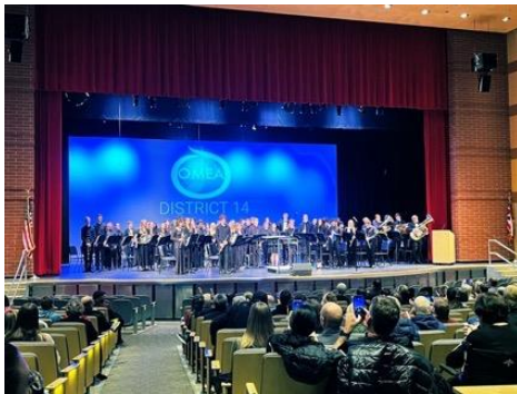
Congratulations to the 35 FHSD students who were selected to perform in the OMEA District 14 Honor Band!