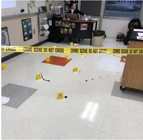
Students in Forensics class examined a 'crime scene'!