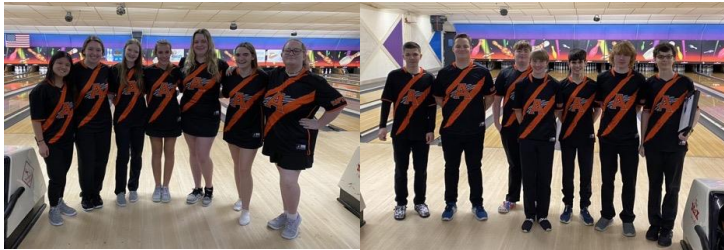
Had a blast cheering for our bowling teams this week!