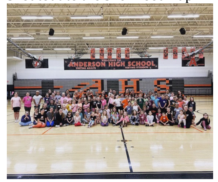
Our Dance Team put on an amazing clinic for the young dancers in our community!