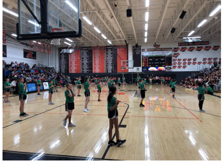
Shoutout to the Sherwood Rapin' Ropes for their performance last weekend!