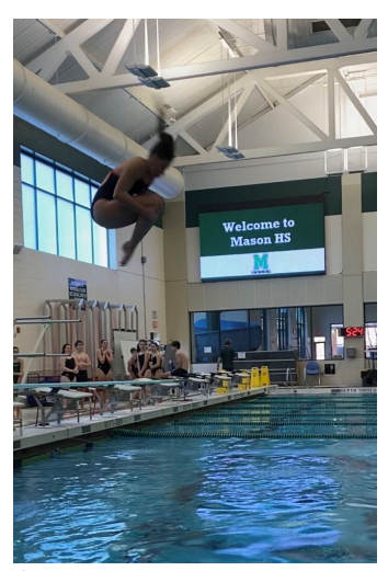
Our Dive Team in action!