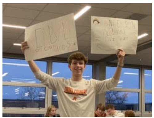
It is so awesome how our students support each other!