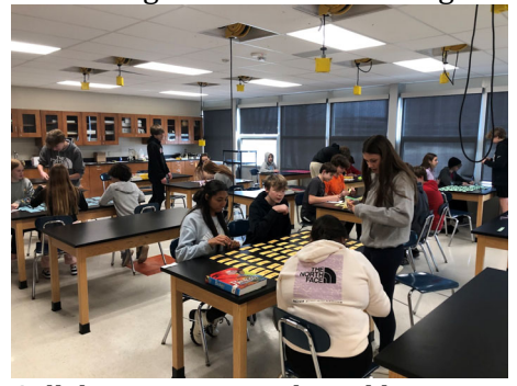
Collaborative, game-based learning in Biology!

Senior English students utilizing the breakout rooms in our Learning Commons to collaborate!