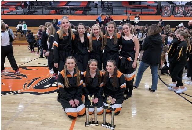
Our award-winning dance team have been excellent teachers for those of us performing tonight!