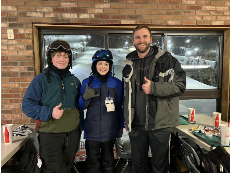
Hitting the slopes with Ski Club!