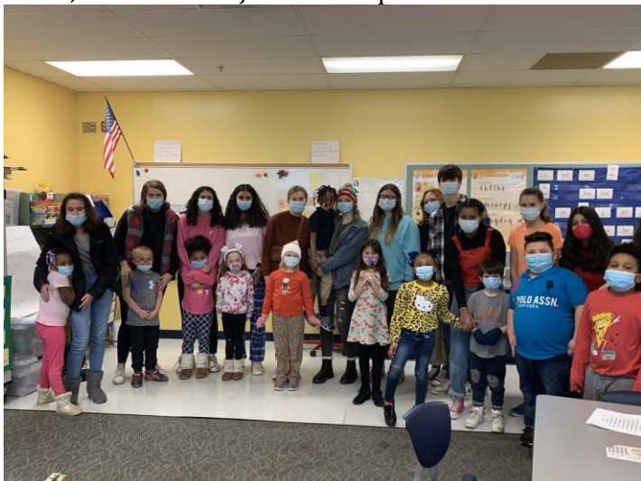
Key Club recently visited their friends through the Adopt-A-Class Program