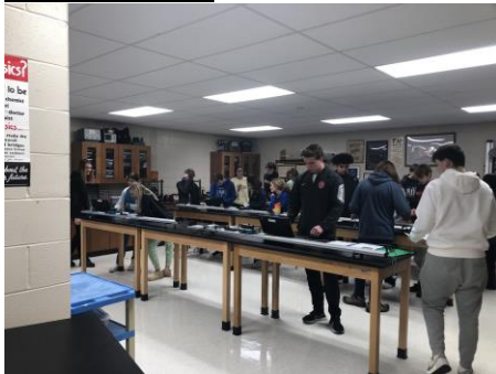
Hands-on learning in Physics!