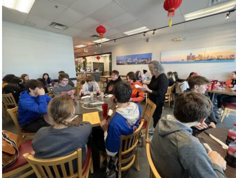
Students in Mandarin class on their field trip this week!