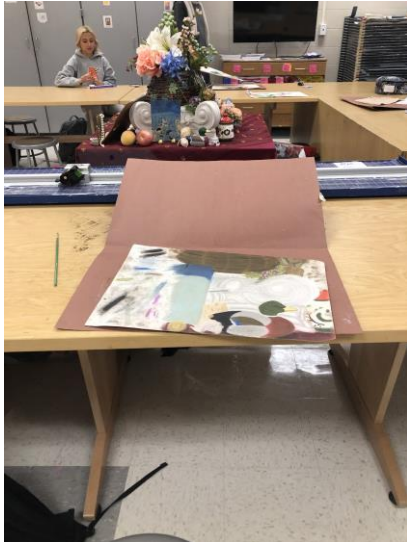
Still-lives in Drawing and Painting!