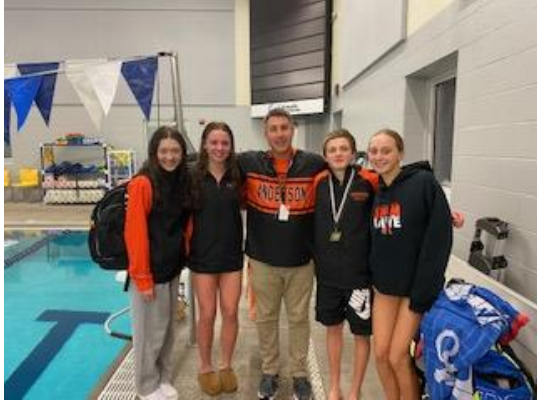
Our AHS Dive Team had a VERY successful evening at the ECC Championships!