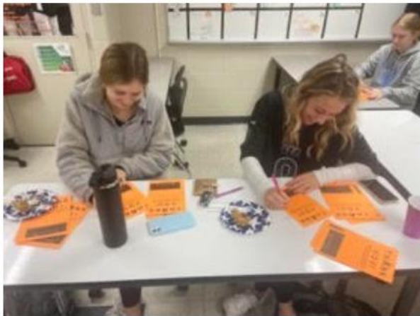
AHS SALT Students writing 'Thank You' cards to our awesome bus drivers!