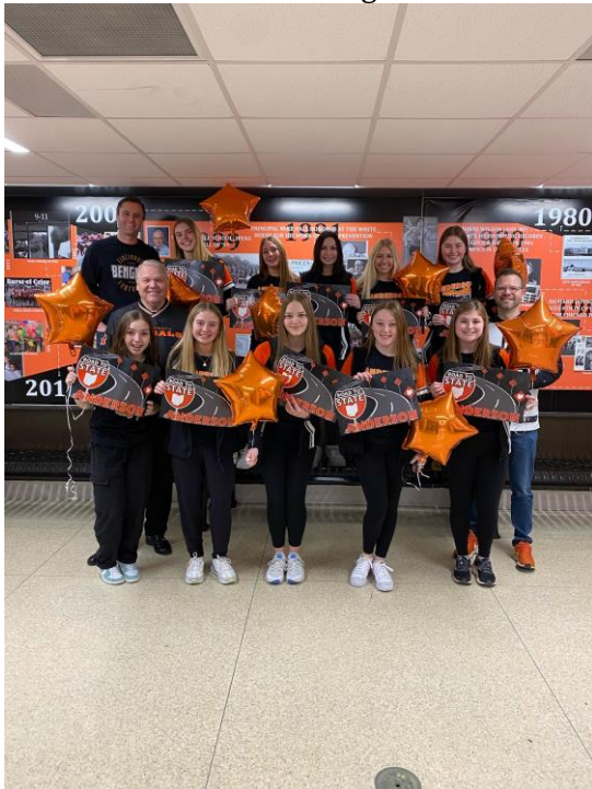
Good luck to our dance team at State!