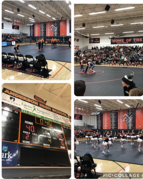
The In-School Wrestling Dual!