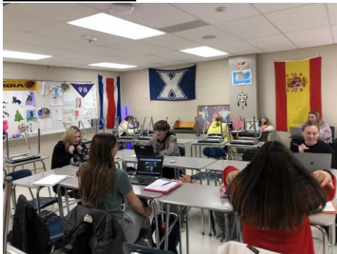
AP Spanish students talking with their virtual 'Pen Pals' in Colombia!