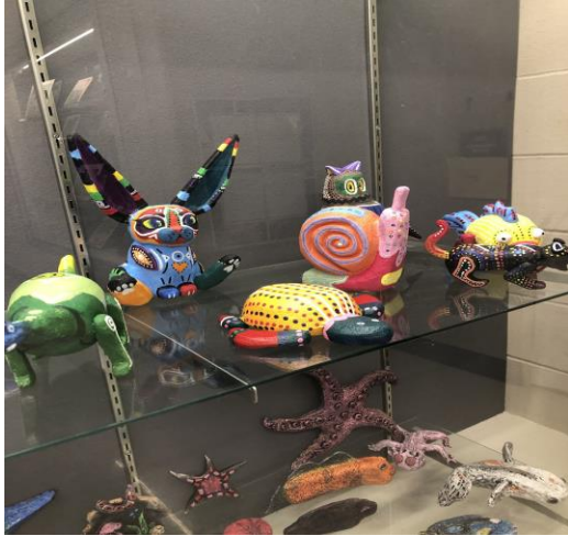
Showing off the work of our Sculpture and Ceramics students!