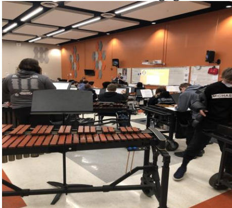
Earning Excellent and Superior ratings comes from hours and hours of practice!