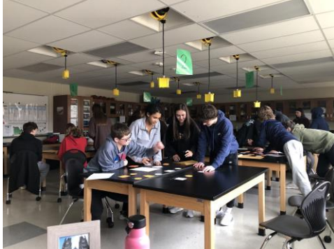
Biology students working on their Pedigree Group Challenge!