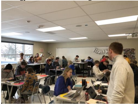
Pre-Calculus students engaged in learning on teacher 'Open Door Day'