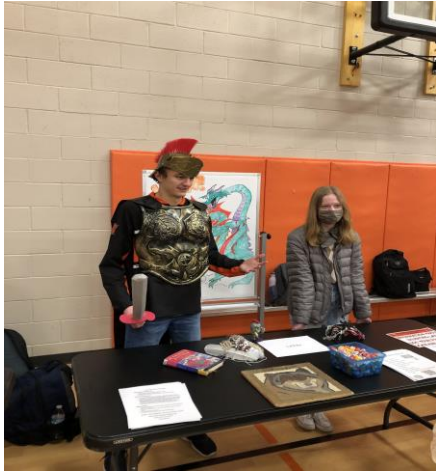
Our upperclassmen did a great job bringing the content to life at the AHS Electives Fair!