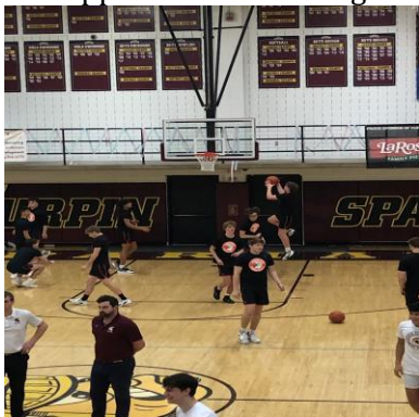
Boys basketball had a GREAT win on Tuesday!