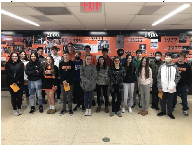
We took a moment to celebrate our Science and Innovation Expo winners!