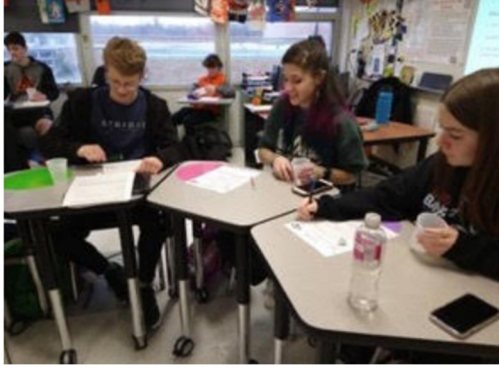
Stats students working on confidence intervals!