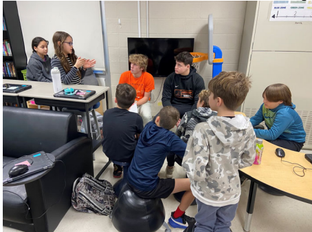
Some of our Student Athlete Leadership Team took time to meet with 5th Graders at Maddux about sportsmanship!