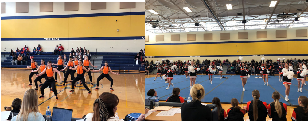
Our Dance and Cheer teams did a great job at the ECC Championships!