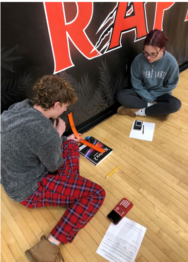
Math in motion in Algebra II class!