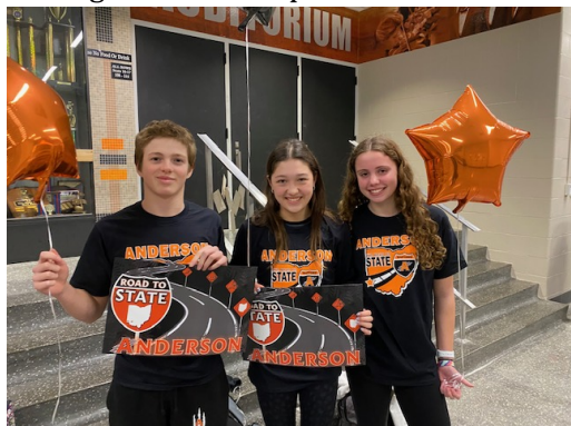
We had a State Walk Send-Off for these amazing divers!