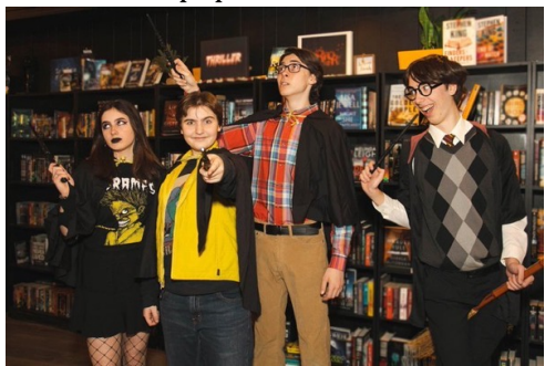
Come see Puffs this weekend! (info below)

Sometimes I pop into our fine arts classes just to listen, our kids are so talented!