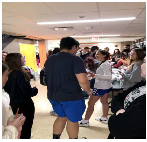
The AHS Hope Squad made hot chocolate to hand out to other students with hand-written positive messages on each cup!