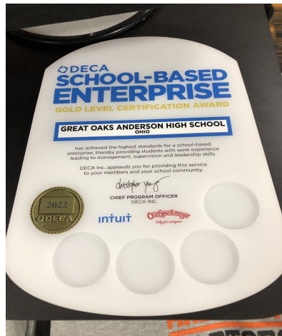
Shout-out to our award-winning student-run spirit shop, The Rapstore!