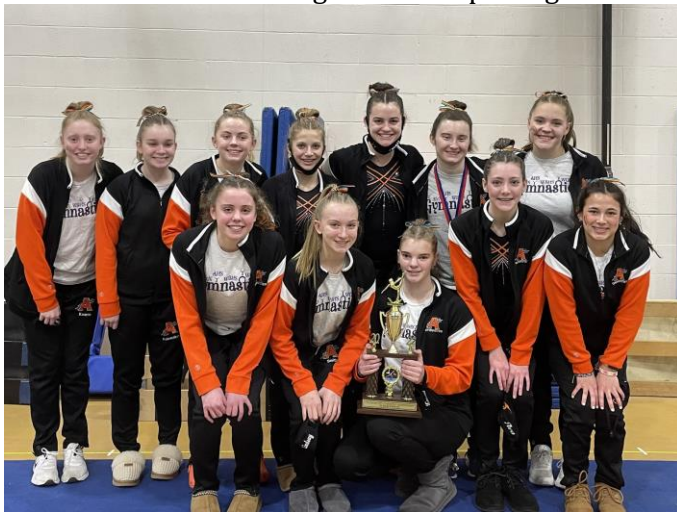
HUGE shoutout to our Gymnastics Team for coming in 2nd place at the City Championships!