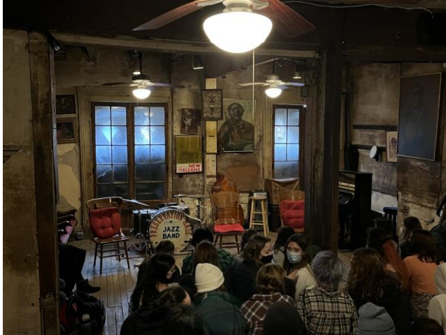
The Forest Hills Marching Arts are exploring New Orleans' rich music history this weekend!