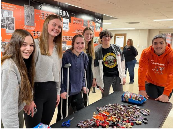
AHS HOPE Squad members continue Wednesday Random Acts of Kindness!