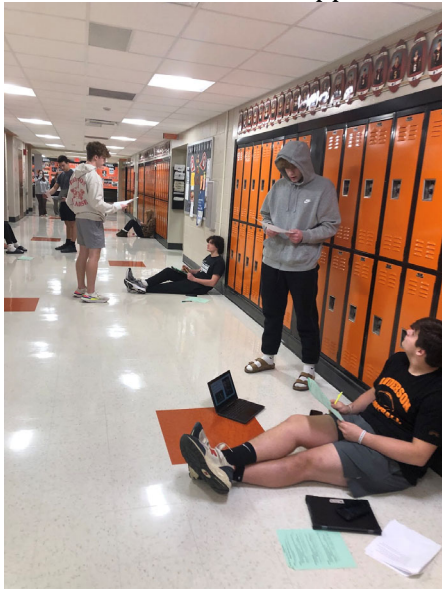
English 10 students practicing their persuasive essay speeches!