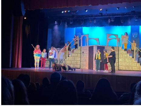
AHS Theater did not disappoint, Puffs was outstanding!