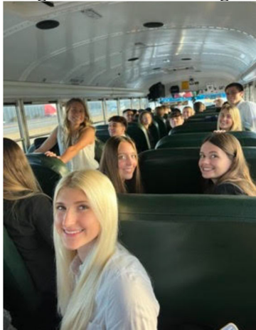
FBLA Students on their way to Columbus for competition!