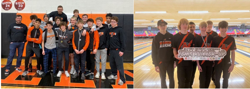
Congrats to our wrestling and boys bowling teams for finishing 2nd in the ECC!