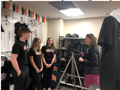
Thanks to Fox19 for featuring our award-winning DECA students and their student-run spirit shop, the Rapstore!