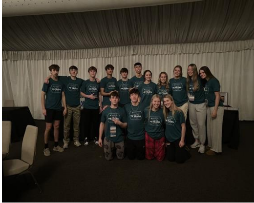
AHS FBLA Students did a great job competing in state competition this week!