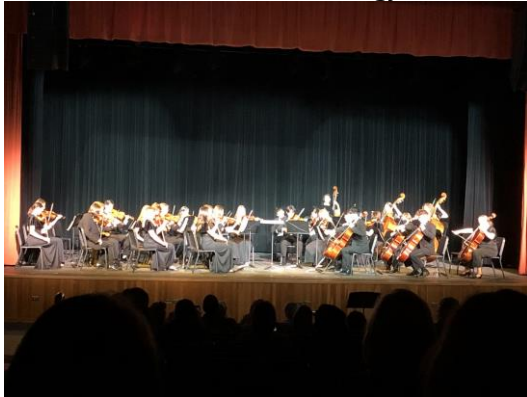
AHS Orchestras sounded great as they prepared for the OMEA competition!