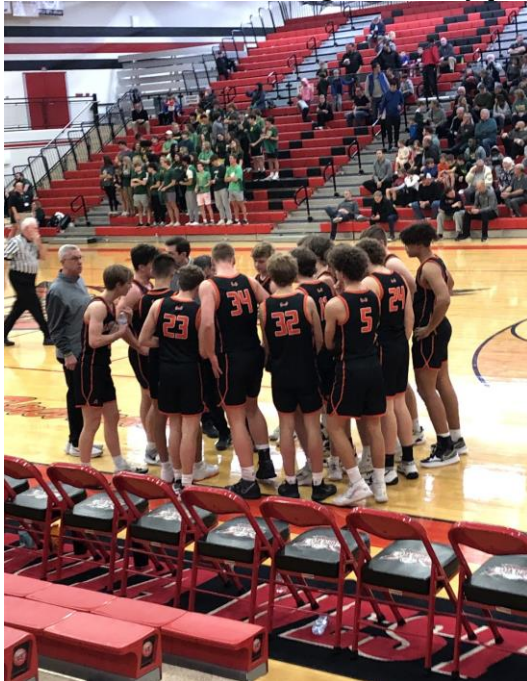
Boys basketball capped off their season with a great performance!