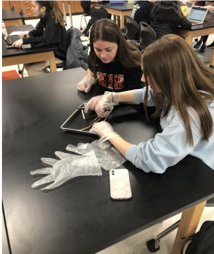
Worm dissections in AP Biology!