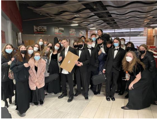
Congratulations to our orchestras for a job well done at the OMEA competition!