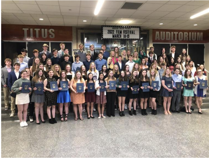
Congratulations to the 79 newest members of National Honors Society!