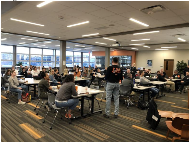
We had an amazing staff Professional Development day today!