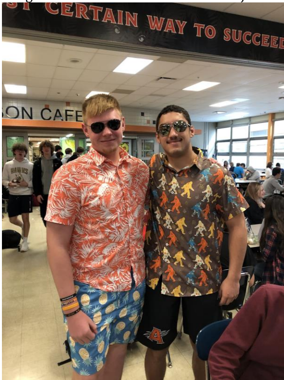
We had fun with spirit week leading up to the Spring Fling!