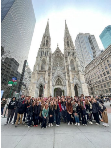
Choral students had a great trip to NYC!