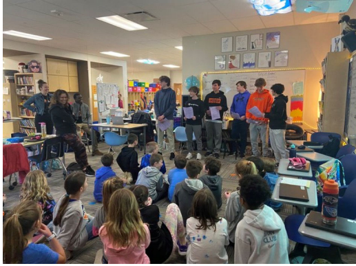
AHS SALT continues doing a great job of spreading the message of sportsmanship to our elementaries!