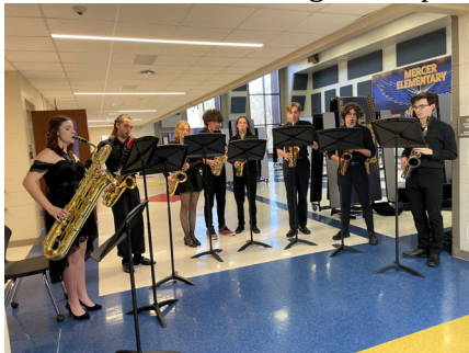
Thanks to these talented musicians for performing at this week's BOE meeting!