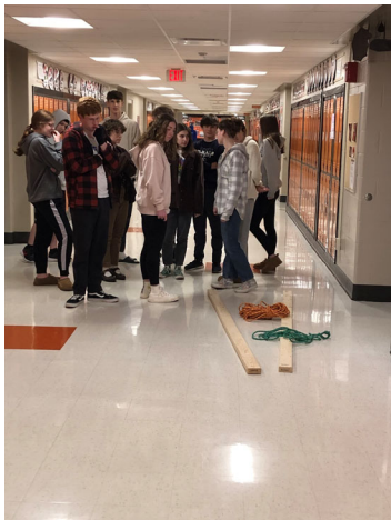
AP English Language and Composition students working on a creative introduction to their new novel!