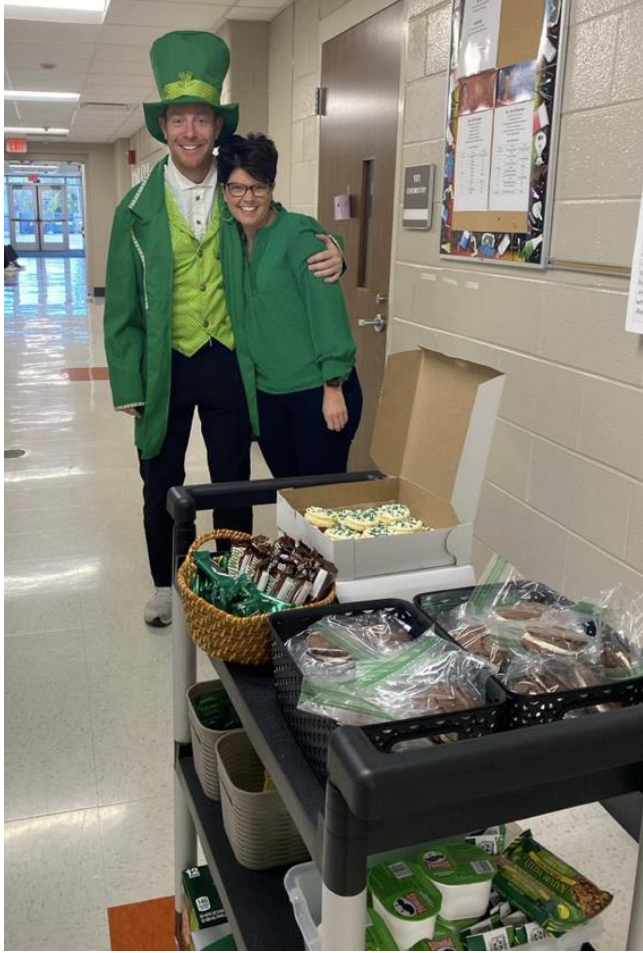
A huge thank you to our amazing PTO for supporting our staff with the Treat Trolley!