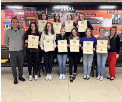
Congratulations to the Teacher Academy students advancing to Nationals and for receiving special commendation from the Statehouse!