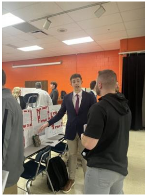
FBLA 'Shark Tank'!