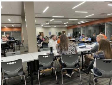
PLC leaders sharing instructional practices Wednesday morning!