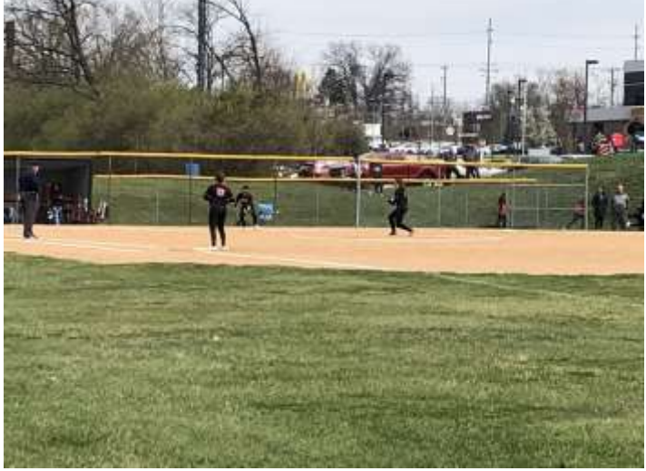
Our Softball team was in action earlier in the week!

Evening for the Arts took place this week; our students are so talented!