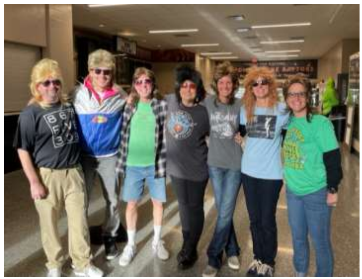
Our teachers were decked out in themes for today's Academic Pep Rally!