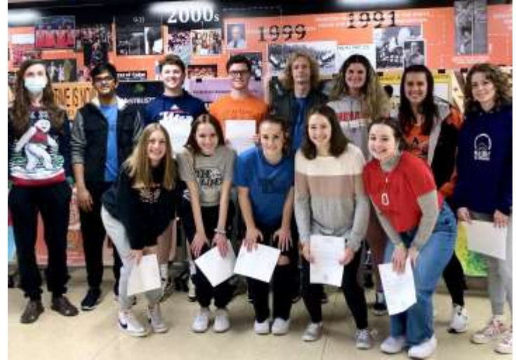
Cum Laude Society seniors being recognized during Prize Patrol!