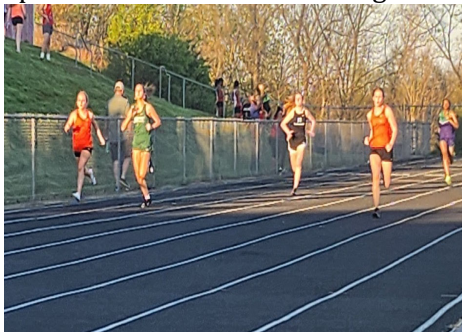
Spring sports are off and running!