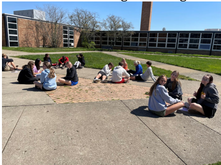
Spanish IV class took advantage of the nice weather!