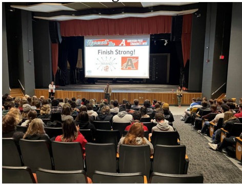
Senior Class Meeting- focusing on finishing strong!