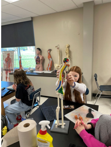
Hands on learning in Science!