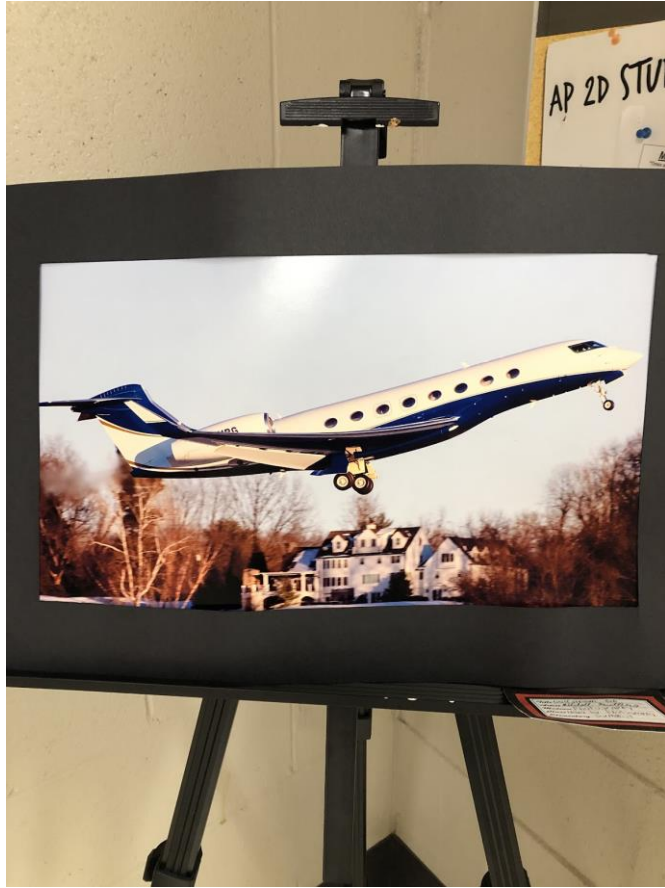
Our photography students take the most interesting pictures!