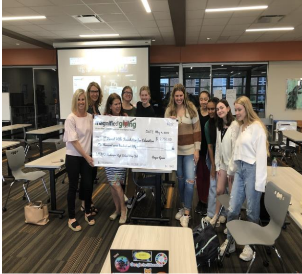
Thanks to Key Club and Magnified Giving for their fundraising efforts for the FH Foundation for Education!