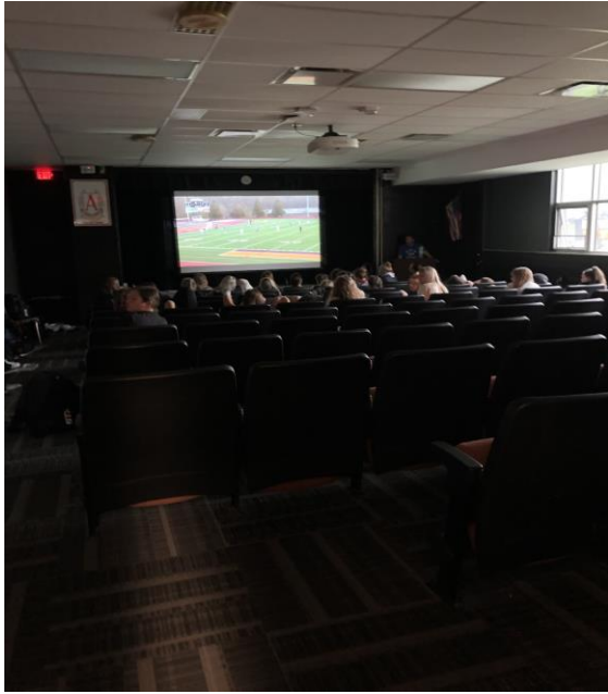
When Mother Nature ruins your practice plans, you get some extra film study!