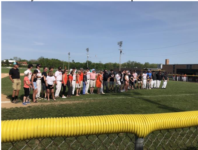
Baseball senior day!