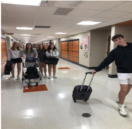
This may have been the most fun spirit week I've ever seen!