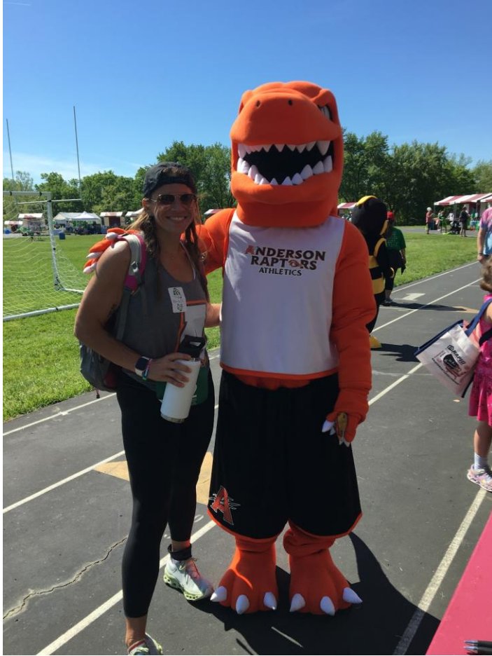
Big Shout-Out to 'Rowdy' for winning the Mascot Race at the FH5K!