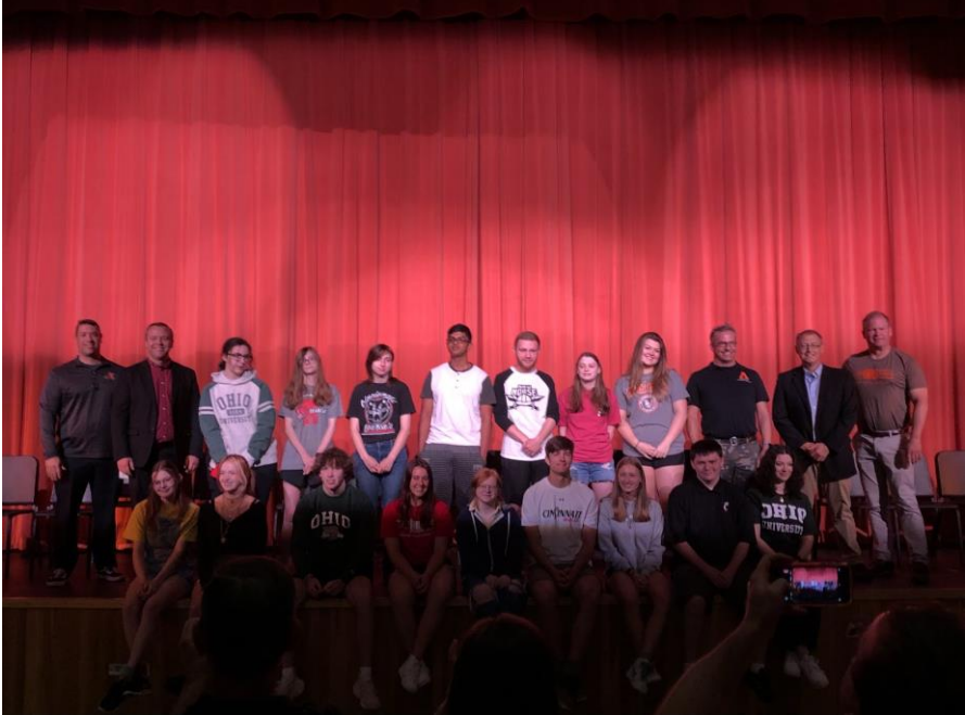
The Three A's Signing Ceremonies!