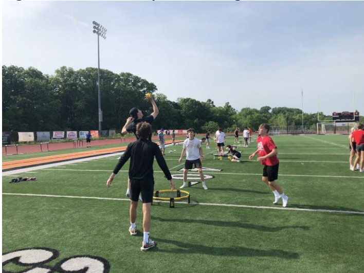
The first-ever Senior Field Day was a huge hit! Thank you to all the volunteers!