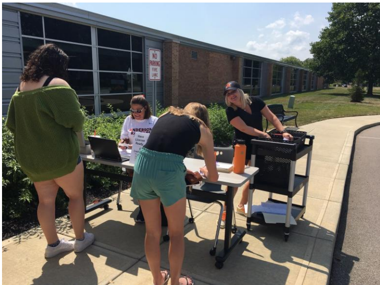
Selling parking passes can only mean one thing- it's almost to start a new year! Thanks to all involved!