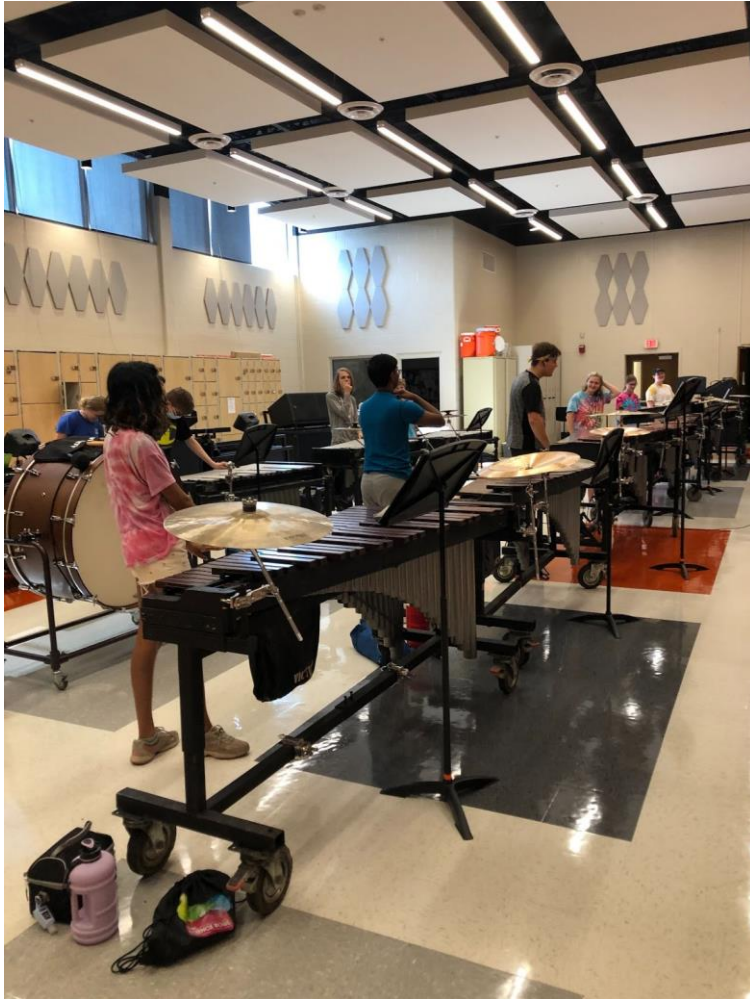
Students in the Forest Hills Marching Band have been working hard the last couple of weeks!