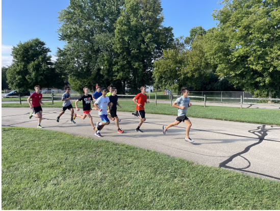
Cross Country is starting to hit their stride!