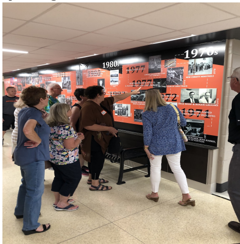
It was such a blast meeting with and giving tours to members of the AHS class of 1972 for their 50th Reunion!