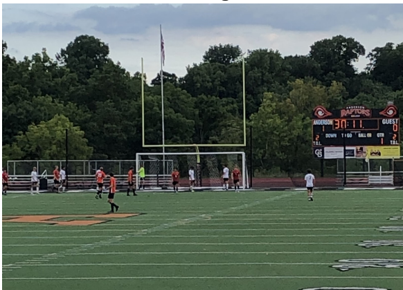
Boys Soccer got their season off to a great start!