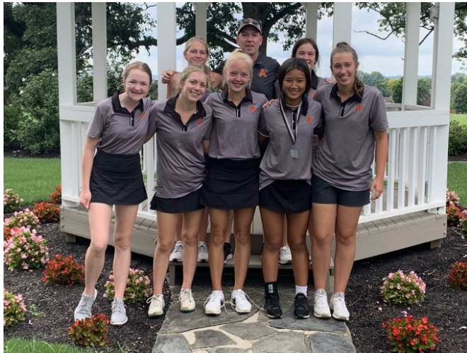
Congrats to our Womens Golf team- ECC Preview Champs!!