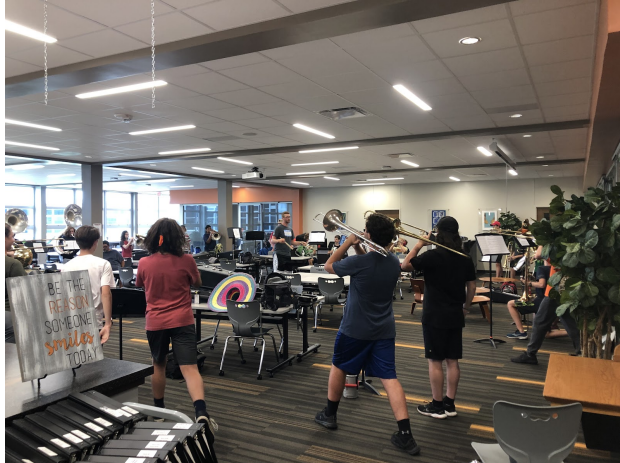
The halls were alive with the sound of music! The award-winning FHSD Marching Arts have gearing up for a great season!