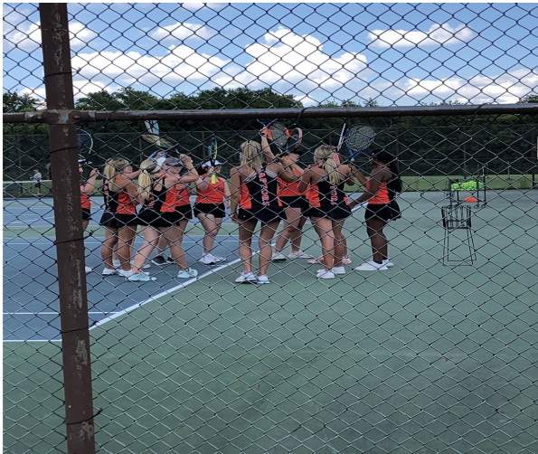
Girls Tennis is in full swing!