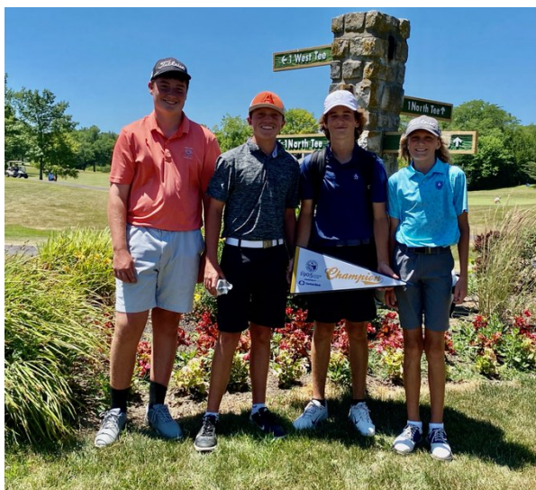
The Raptor golf teams are tee-ing up for an amazing season!