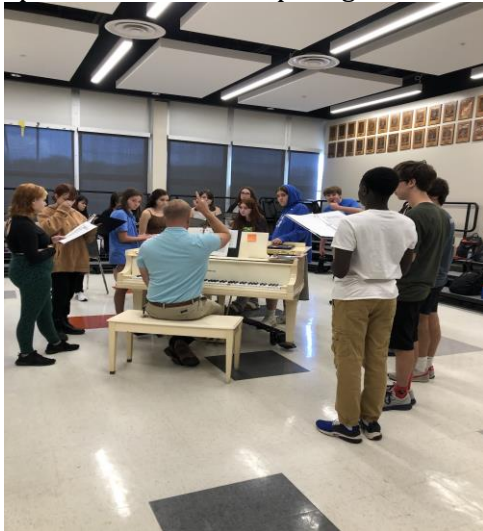
Chamber Choir was hitting all the right notes!