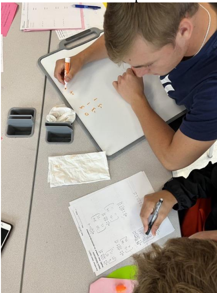
Collaborative learning in Pre-Calculus!