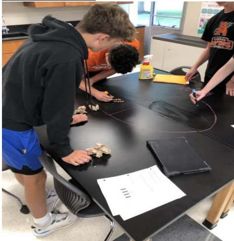
Biology students working on modeling and graphs!