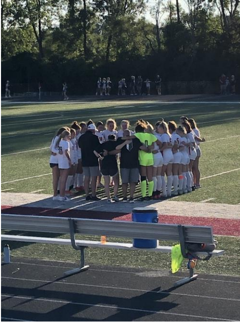
Girls soccer had an impressive in-conference win Tuesday night!