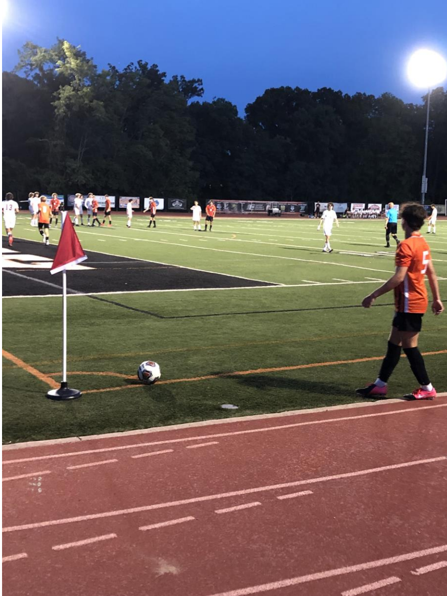
Boys soccer picked up a nice win over Lebanon this week!