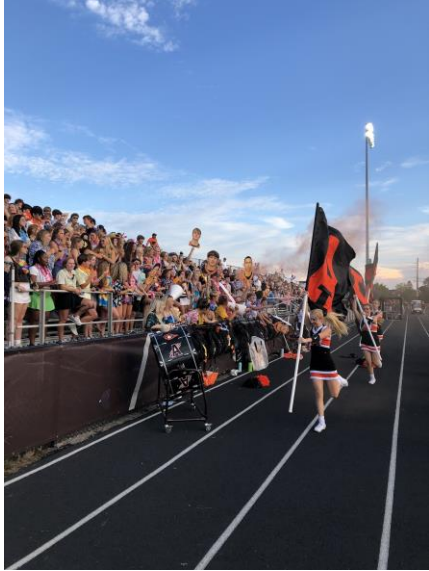
Come on out to Friday Night Lights!