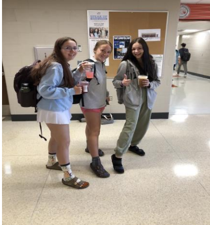
What a great spirit week! Socks and Sandals Day was a hit!