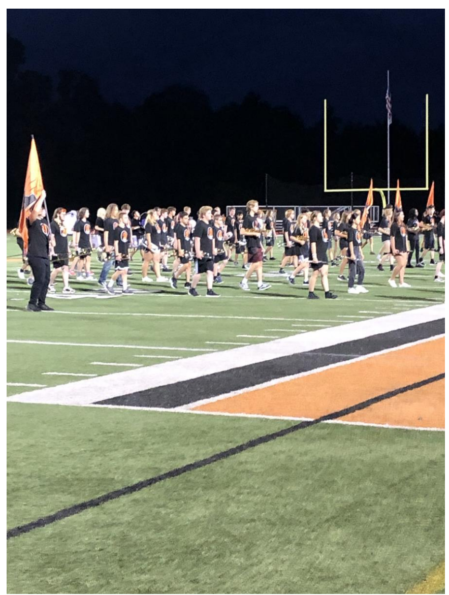
The Pride of AHS always puts on a great show!