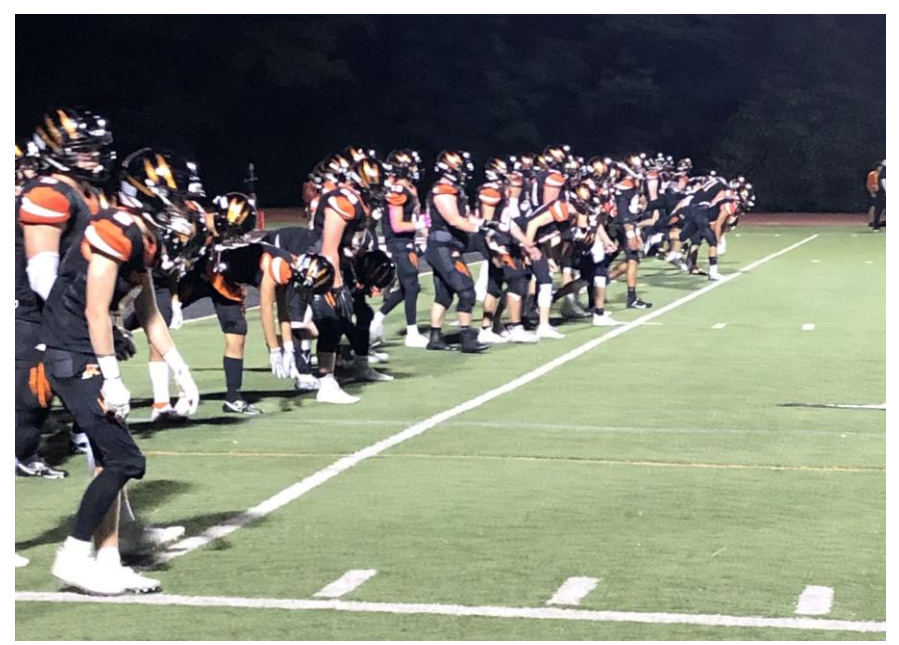
Friday Night Lights!