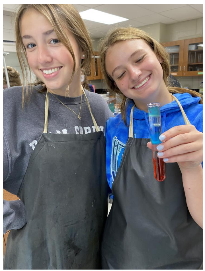
Chemistry students sharing their lab work!