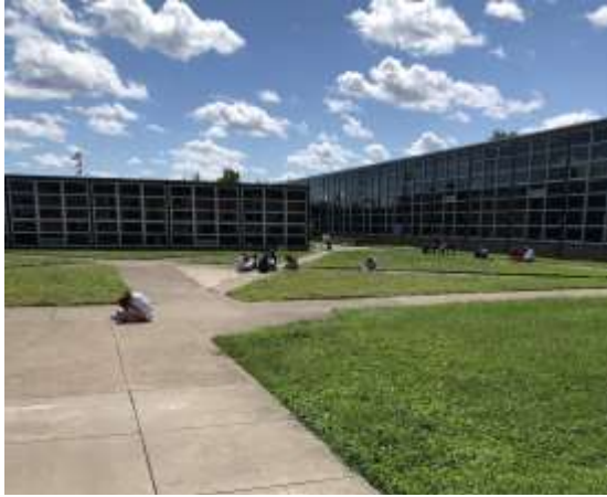
AP English Language and Composition classes took advantage of some nice weather!