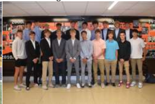
Girls AND Boys soccer had GREAT wins this week over a neighborly opponent!