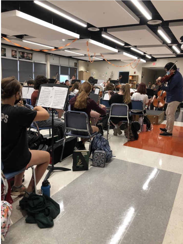
Why are our performing arts so good? They practice really hard!