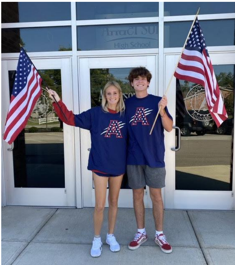
Tonight (9/17) is our Military Appreciation Night!