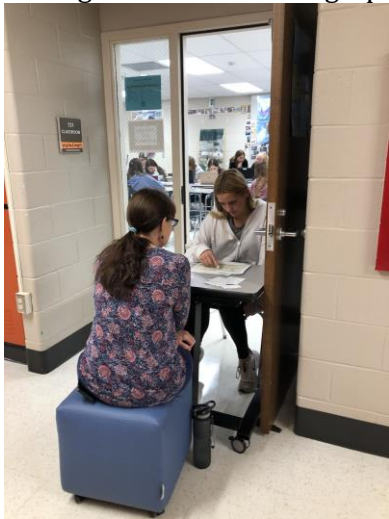
Students in Spanish class practiced their vocabulary and speaking skills!