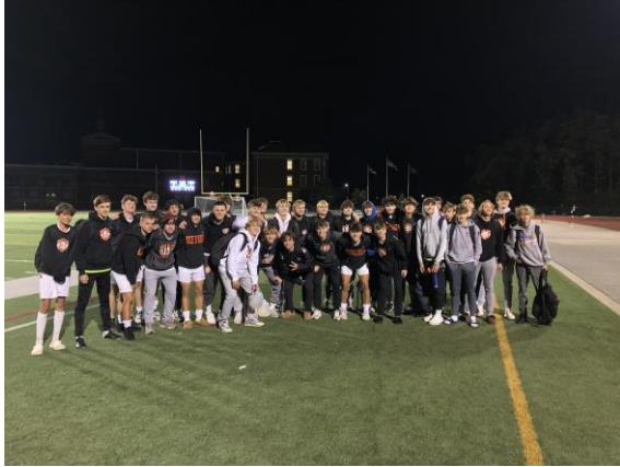
Boys soccer picked up a massive win this week to move up to first place in the ECC!