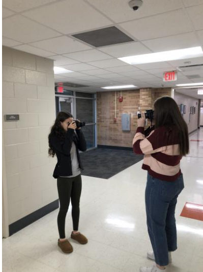
Having some fun in Photography class!