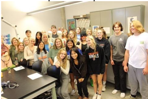
Students in Medical Interventions class had a great field trip to NKU's labs!