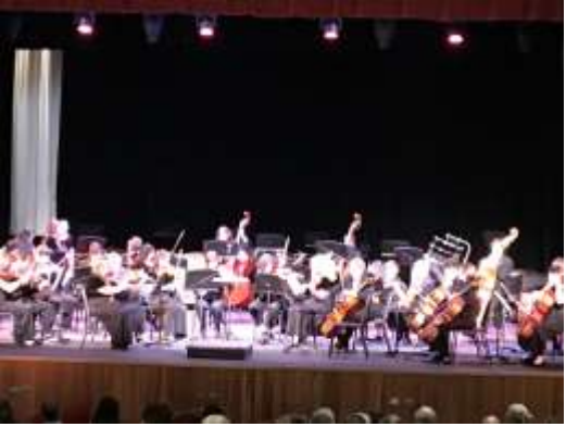
First Orchestra concert of the school year!