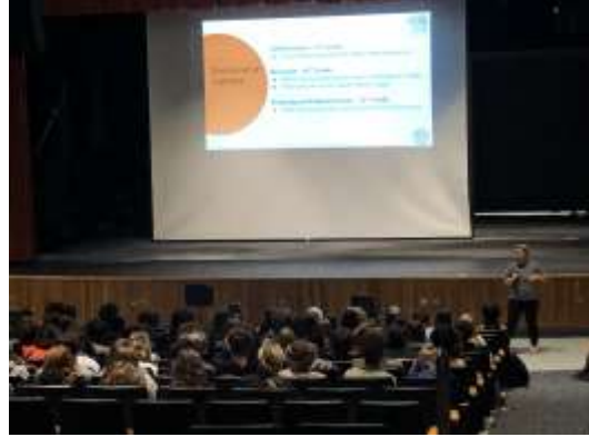
Our counselor led a presentation for our Juniors about getting ready for their next steps after high school!