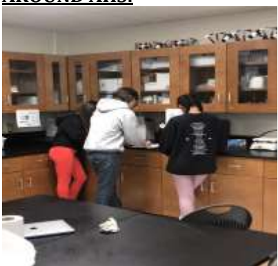
Station rotation in Biology!