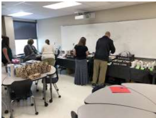
We cannot thank our PTO enough for always taking care of our staff!