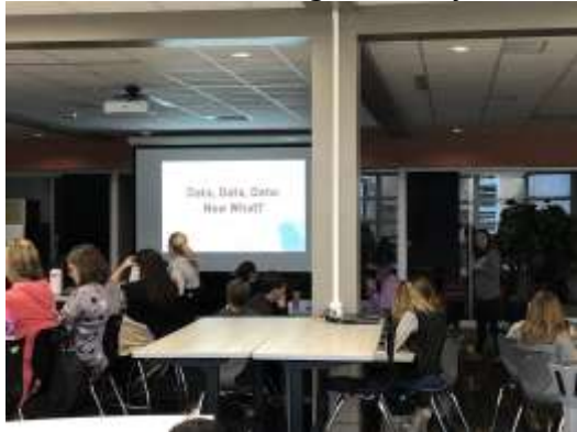
We had an AWESOME day of teacher professional development today!

We had fun celebrating our volleyball seniors this week!