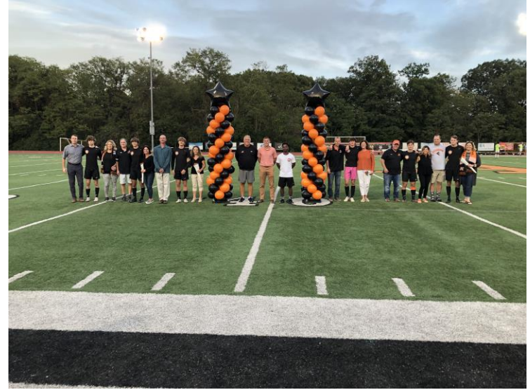
Boys soccer finished the regular season undefeated on senior night!