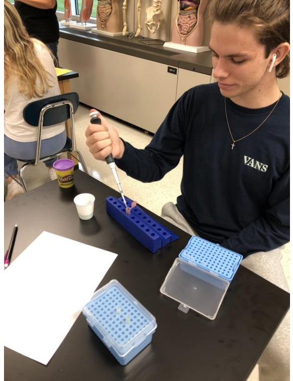
Students in Human Body Systems class working on their lab skills!