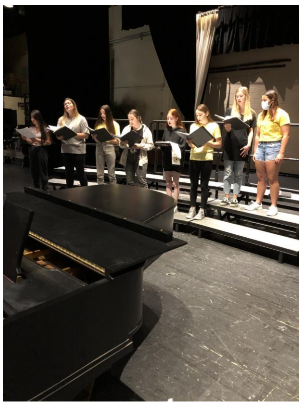
Members of our Chamber Choir getting ready for the upcoming concert!