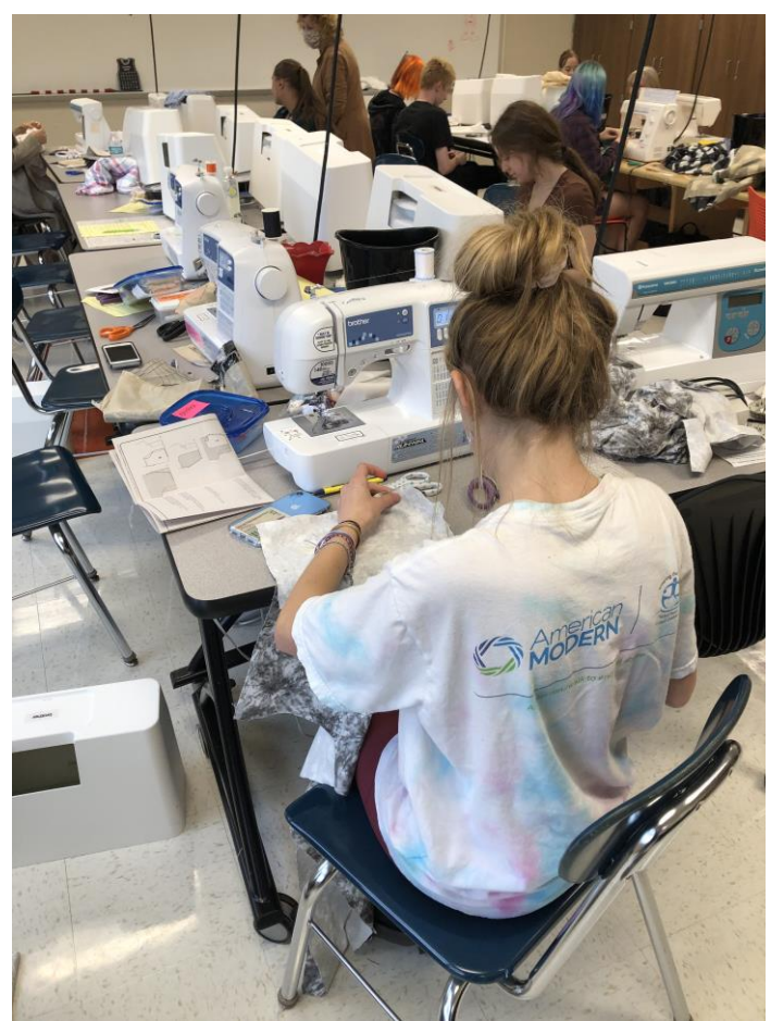
Students hard at work in our Fashion Design and Selection class!