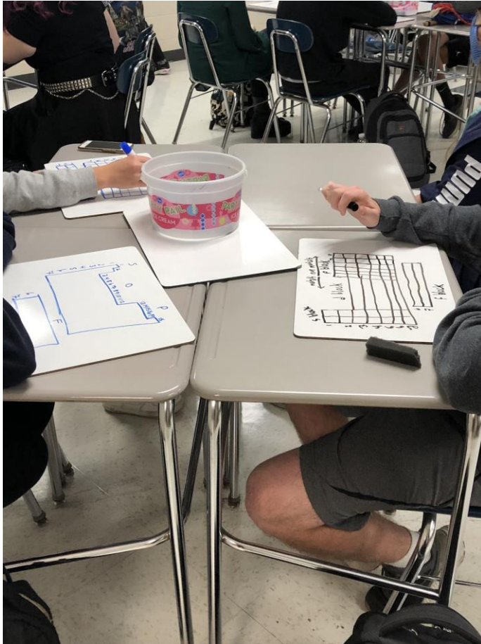
Chemistry students learning about the Periodic Table of the Elements