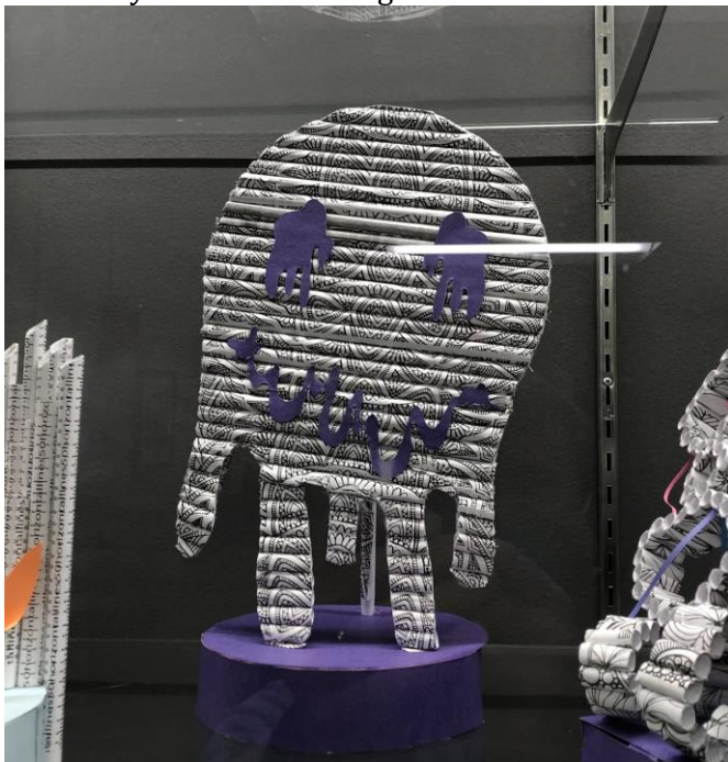
Our visual arts students always impress me!