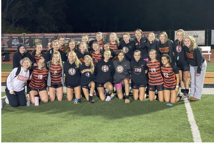
Our women's soccer team won two playoff games this week!