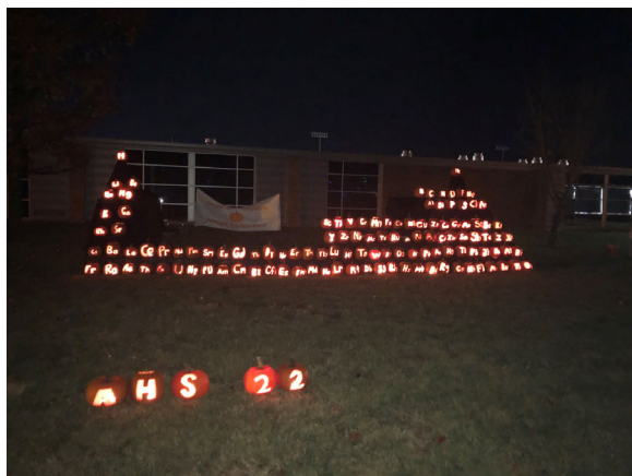
The 8th Annual Periodic Table of the Pumpkins! Great job, Chemistry students and teachers!