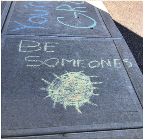
HOPE Week activities!