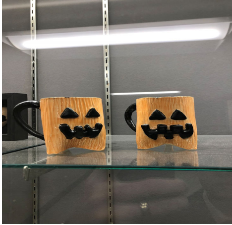
Sculpture and Ceramics students getting in the spirit of the season!