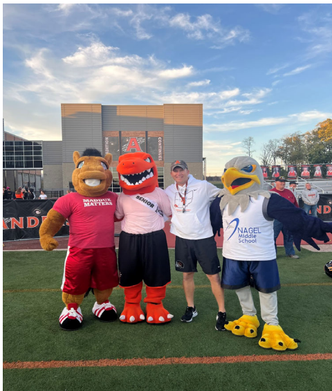
Even 'Rowdy' got in on the Senior Day fun last week!