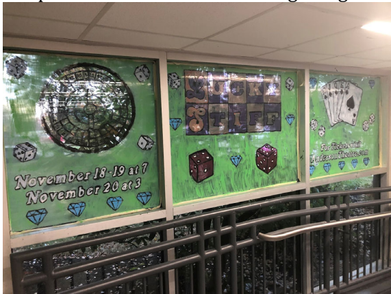
We're a few short weeks away from our first Theatre production of the school year!