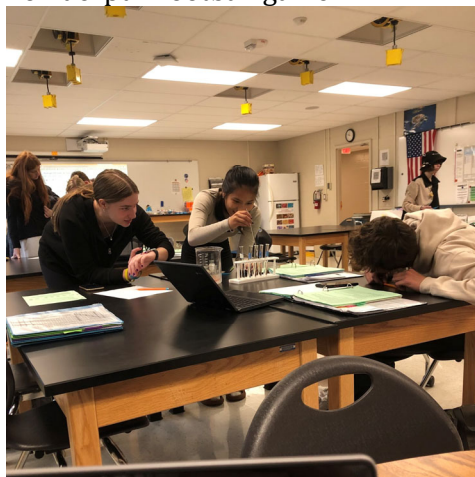
Hands-on learning in AP Biology!