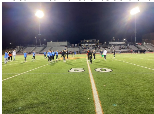
Powderpuff football game!