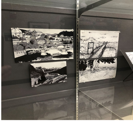
Artwork on display from our Drawing and Painting students!