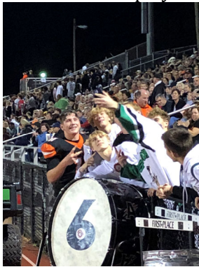
The Raptor Football team continues their run in the state playoffs tonight!