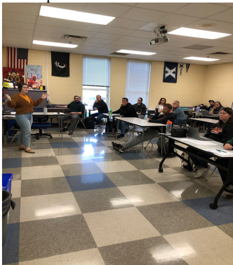
Many AHS teachers led sessions during Tuesday's staff professional development day!