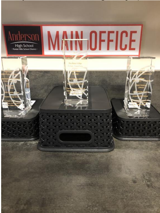
We have actual Emmys in our school- shout-out to our film program!