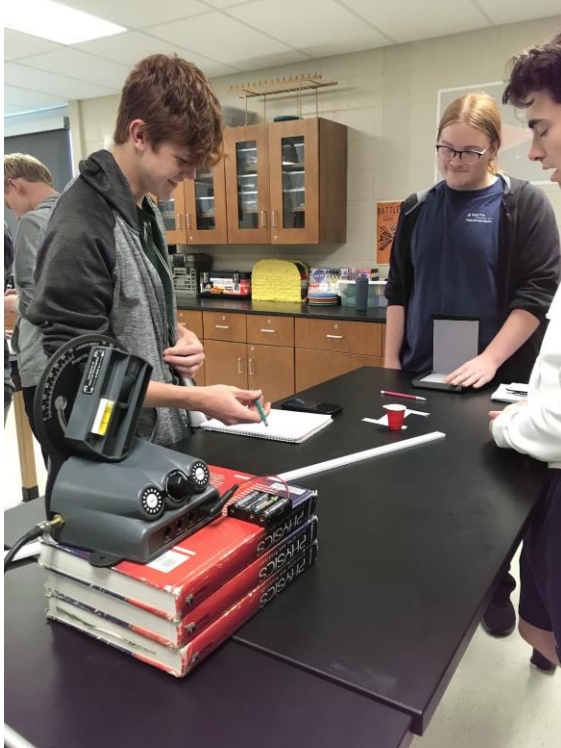
AP Physics students working with projectiles!