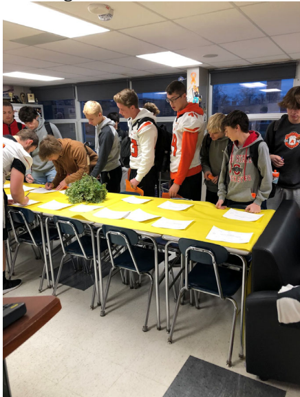
SALT students participated in a morning of service today!