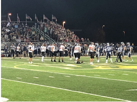
Good luck to our football team in the Regional Final!