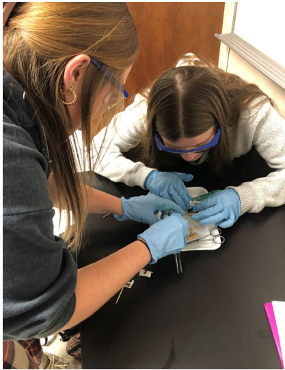
Dissecting sheep's eyes in science class!