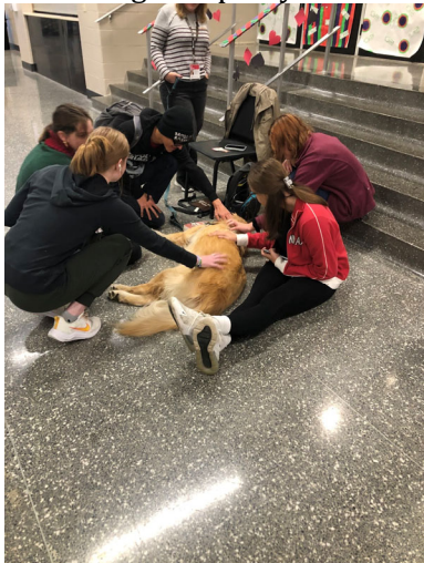
Emotional support dogs were available for all students and staff today and yesterday!