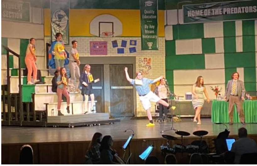
We're all excited for Spelling Bee this weekend!