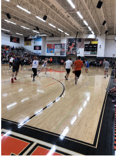
FBLA presents: the Senior/Staff Basketball Game!