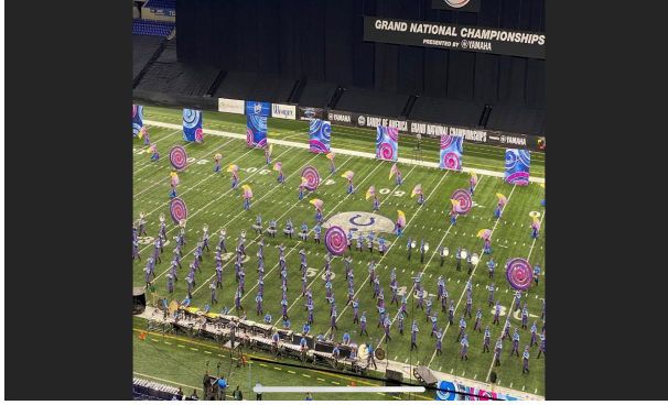
We are so proud of the FH Marching Band for their performance at Nationals recently!