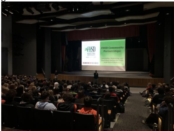
Sophomores and Juniors learned about the FHSD Community Partnership program this week!