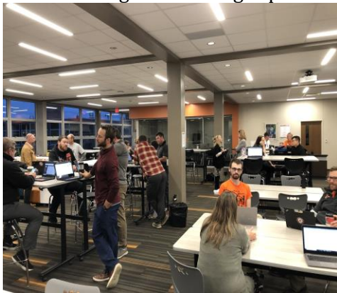
PLC Leaders met this week to share out successful instructional strategies to promote student growth!