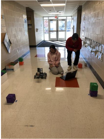
Robotics is a great learning experience for students!