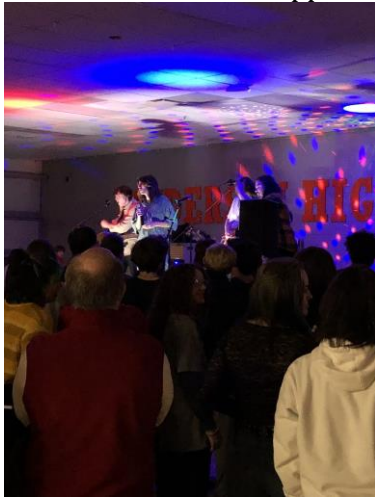
Congratulations to Never Not Rockin' for winning Battle of the Bands!