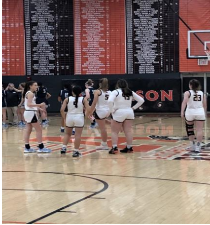
Girls Basketball have tipped off their season!