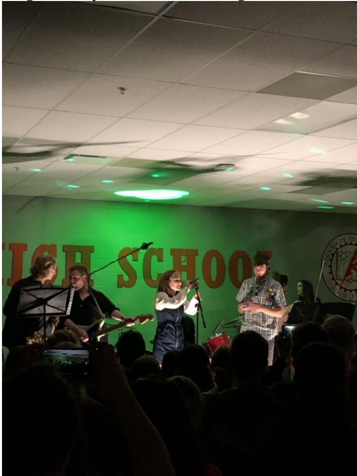
Congrats to Moke and the Blokes on winning this year's Battle of the Bands!