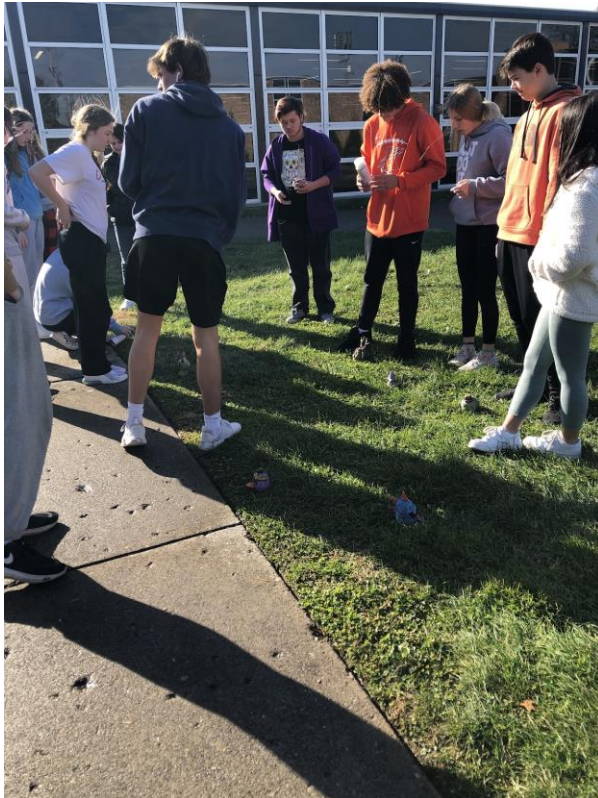
Ceramics students applying glaze to their projects!