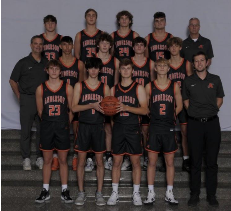
Congrats to boys basketball on starting their season with a sweep!