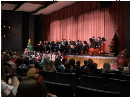
AHS Orchestras Presents: The Nutcracker was outstanding fun for the whole family!