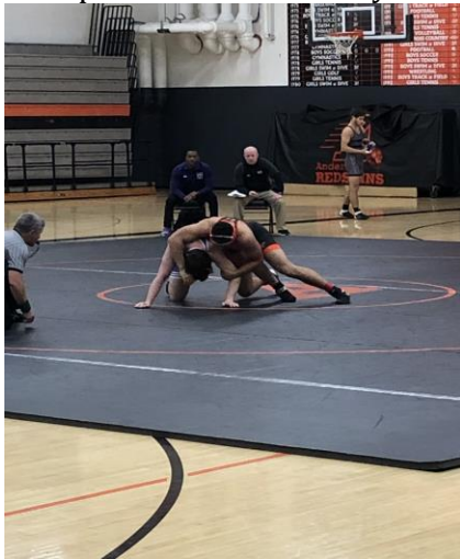
The AHS Wrestling team has looked impressive on the mat so far this season!