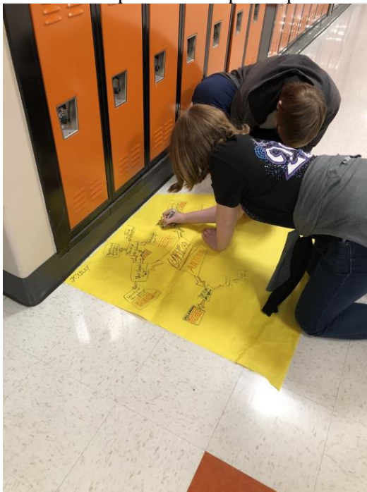
Students in English class working on concept maps!