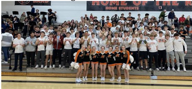
The AHS Cheerleaders and our Rowdies know how to bring the noise!