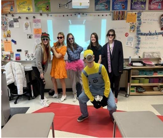
Students in Spanish class participated in a “fashion show” this week!