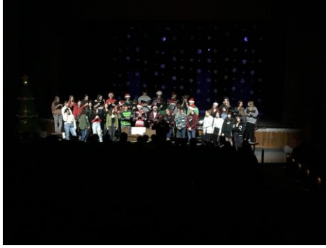
Last Friday, we held an in-school Choir Concert so our talented singers could perform in front of their peers and raise money for their trip to New York!