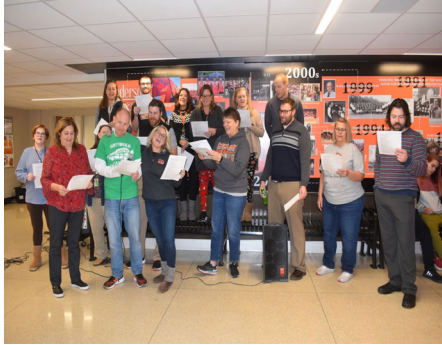
AHS Staff members have been greeting our students in the morning with song the last week or so!