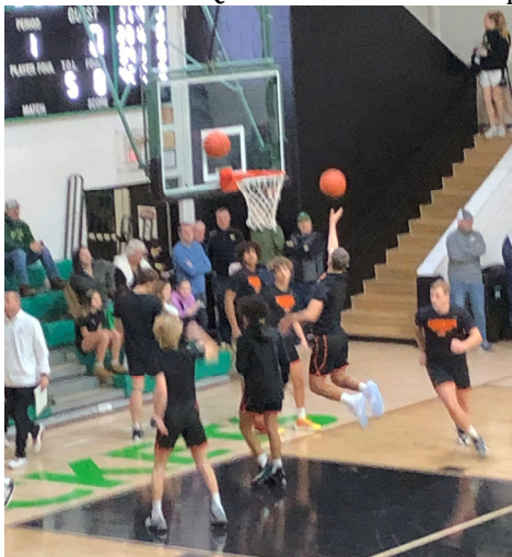
Basketball season is in full swing!