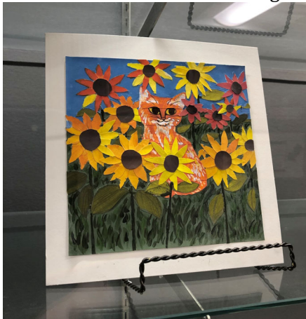
I love walking around the building and seeing all of the student artwork on display!