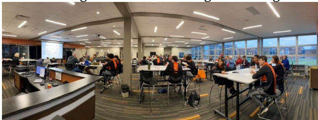
The Academic Quiz Team season is up and running!