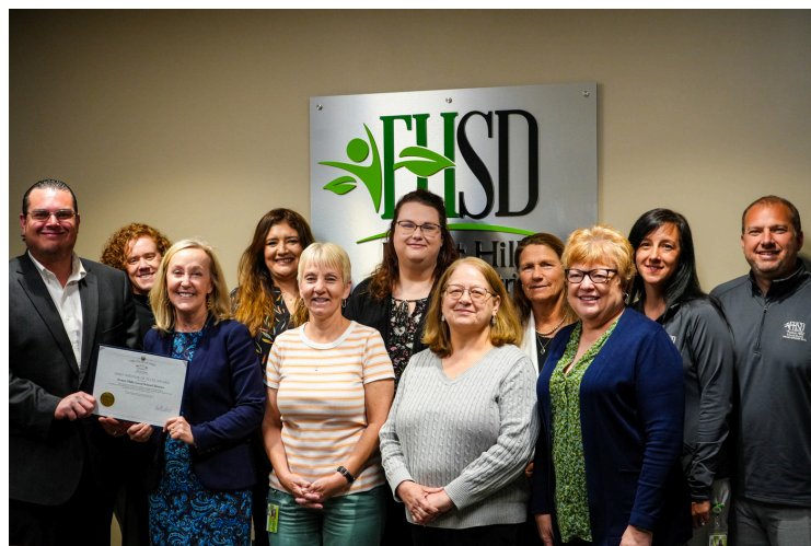
The Ohio Auditor of State's Office presents Forest Hills School District with its Auditor of State Award in recognition of accurate and effective financial reporting.

alanacropper@foresthills.edu (513) 231-3600