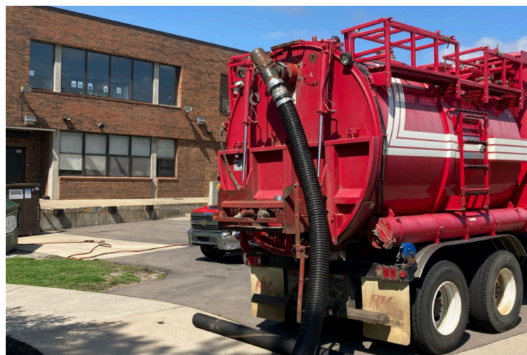
Summer facilities projects will address a variety of pressing building needs, including this roof work currently taking place at Mercer Elementary.