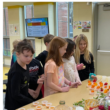
Summit Elementary students try some new, healthy snack options.