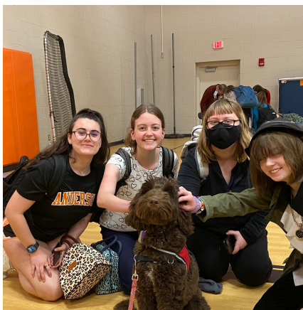
Anderson HS students enjoy some down time with a therapy dog.

FHSD has placed a strong focus on enhancing mental health supports for students and staff. In March, the district's wellness team hosted an informative presentation about mental health and teen suicide with perspectives from expert community partners. The group also organized a training session for coaches to support mental strength and wellness in athletics. Each building hosts regular wellness events which included Healthy Habits Week in the elementary schools, Wellness Week at AHS and several others this semester.