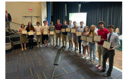
Turpin High School National Merit Scholars