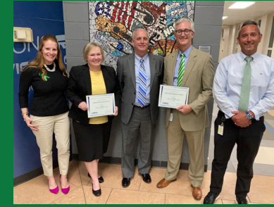
Summit Elementary and Sherwood Elementary Hall of Fame Award