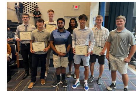
Anderson High School National Merit Scholars

The Ohio Academy of Science announced this fall that Anderson High School and Turpin High School have been selected to receive the Governor's Thomas Edison Awards for Excellence in STEM Education and Student Research for their accomplishments during the 2021-2022 school year. AHS and THS were the only two schools in the Cincinnati area selected for this honor.